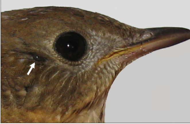
FIGURE 2. Hermit thrush parasitized by an engorged nymph of the rabbit tick, Haemaphysalis leporispalustris .

disease–endemic foci. Combining the present study and a previous pan-Canadian study (Scott et al., 2010), we have detected B. burgdorferi in 6 different bird-feeding Ixodes ticks. The collection of I. affinis in Manitoba, I. auritulus in the Yukon, and Amblyomma spp. ticks in Ontario illustrates the fact that migratory songbirds carry ticks thousands of km. Based on our high prevalence data for B. burgdorferi , outdoors people need to examine themselves carefully after frequenting grassy and woody habitats. Clinically, doctors need to be alert to the possibility that the ticks, which are discovered, might be infected, and patients treated accordingly (Oksi et al., 1999; Miklossy, 2008). Also, doctors should be aware that infection could happen almost anywhere in Canada.